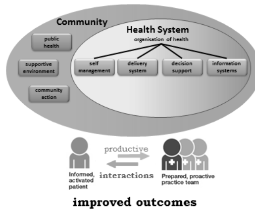
Fig. 2. Expanded Chronic Care Model: adopted from Barr et al. [2].

fectively take care of themselves. Note: health system and community are dealt with in two separate sections below, where the section on “health system” explores the notions of information systems, decision support, delivery system and self-management. The text on the health system is treated purely as background and is not explored in detail.