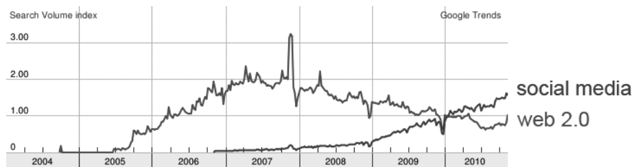
Figure 1. Google trends: “Web 2.0” against “Social Media”

people are talking about Social Media. The Google trend comparison in figure one illustrates this.