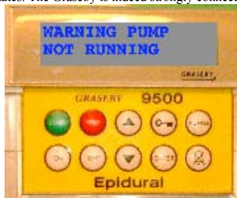
Fig. 1. Partial screen shot of the simulation—a user can mouse click on the buttons, which are animated to give simple visual feedback of pressing. Note that graph theory does not address all HCI issues, such as the naming or confusibility of buttons.

A graph is strongly connected if there is a directed path connecting each pair of vertices; in other words, the user can get from any state to any other state. There are no dead-ends, and no unreachable states. The Graseby is indeed strongly connected.