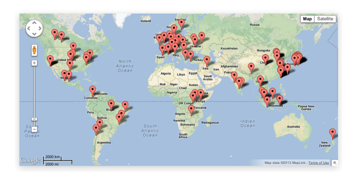
Fig. 2. The geolocation of announced prefixes blacklisted by Google over IPv6. The map was drawn using the gmaps.js library.