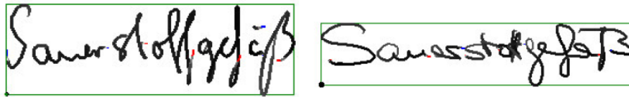
Fig. 2. Handwriting examples of the German word "Sauerstoffgefäß" from two different writers [6].

The class of level 3, the functional semantics is illustrated in Figure 2. This level 3 includes the classification of varying textual contexts used by the writers such as signatures, pin codes, passphrases, symbols, or numbers. Certain information such as "Sauerstoffgefäß" [oxygen container], as exemplified in Figure 2, written by two different writers is semantically equal within this level 3 of the VT model, while it differs from each other in level 1 and subsequently level 2. The meaning of the information is the same even if the signal distribution is varying. This observation is a justification of our model with respect to the possibility to discriminate different writers, even if they write identical text.