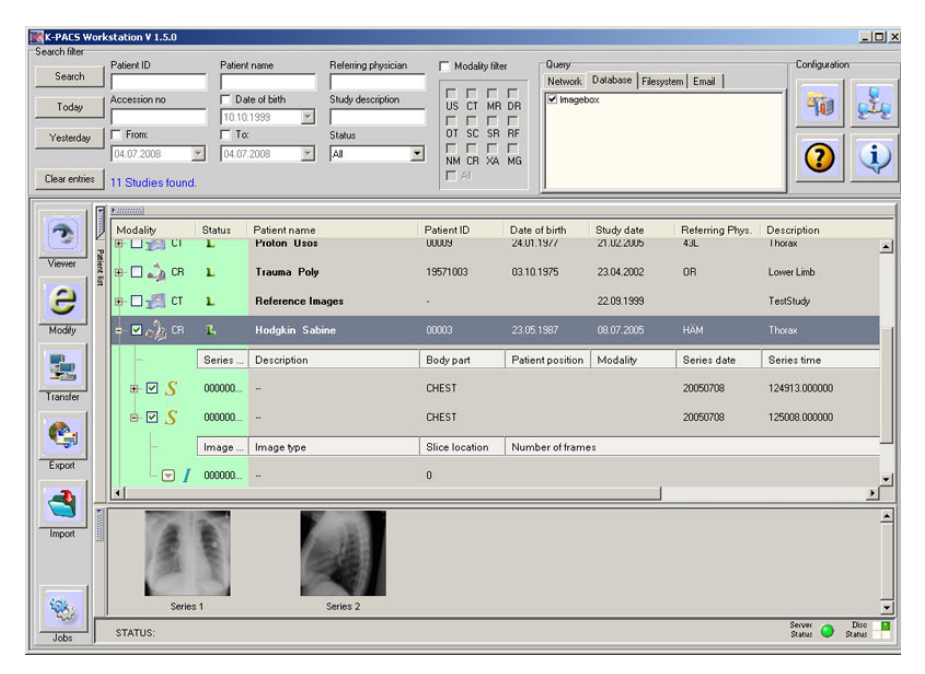
Fig. 1. The main window of the K-PACS system supporting viewing a medical database and searching in it

diagnostics. In order to fully utilise its potential, this data must be stored in the right way, particularly so that it is easily accessible. In this context, it is worth noting that proposed methodology may also be used in the area that combines security and defence aspects in designing advanced systems for the retrieving, acquisition, storing and sophisticated semantic analysis of complex image patterns and group behaviours. In the case of medical diagnostics, this field is currently dominated by systems for archiving medical image data, such as PACS (Picture Archiving and Communication Systems). In particular, these systems are now responsible for the correct and secure transmission, storage and retrieval of image data. The way in which single image is searched in a huge set of image data collected in these databases is the major weakness of these systems. Most frequently, this data is searched for by filling out the appropriate fields with search criteria in the form of alphanumeric data (text and numbers), such as: the patient's personal data, the examination date, the examination description or the selection of the appropriate image modality. Figure 1 shows a typical screen shot from a PACS system.