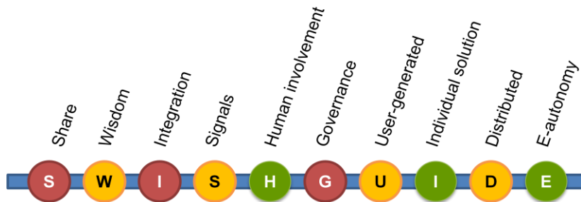
Fig. 1. SWISHGUIDE

Figure 1 demonstrates the SWISHGUIDE categories and the relevant factors of each category. In the rest of this section, the SWISHGUIDE factors will be introduced in more detail.